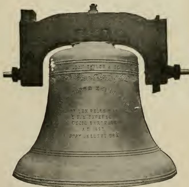
The New Tenor Bell of St. Patrick's Cathedral, Dublin. Weight 45 cwt. 1 qr. 18 lbs.